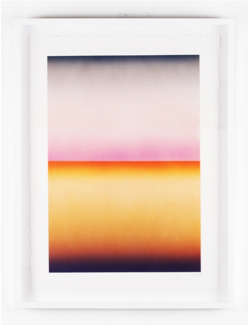
Casper Brindle, Untitled #14 , 2018, acrylic on paper, 30" x 22" unframed, 34" x 26" framed, $3,900