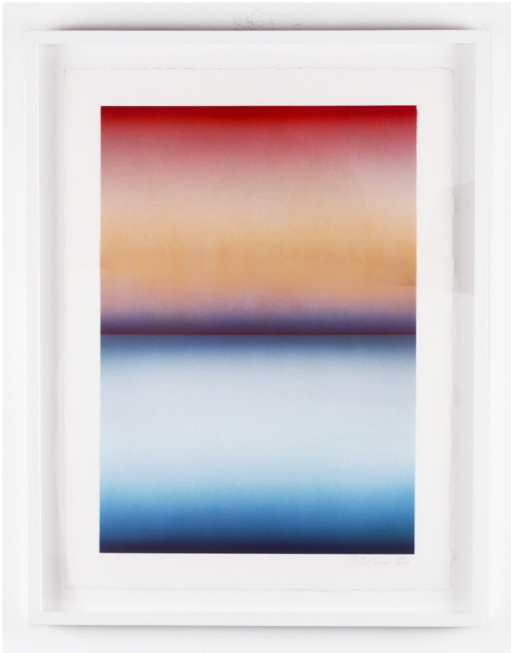
Casper Brindle, Untitled #13 , 2018, acrylic on paper, 30" x 22" unframed, 34" x 26" framed, $3,900