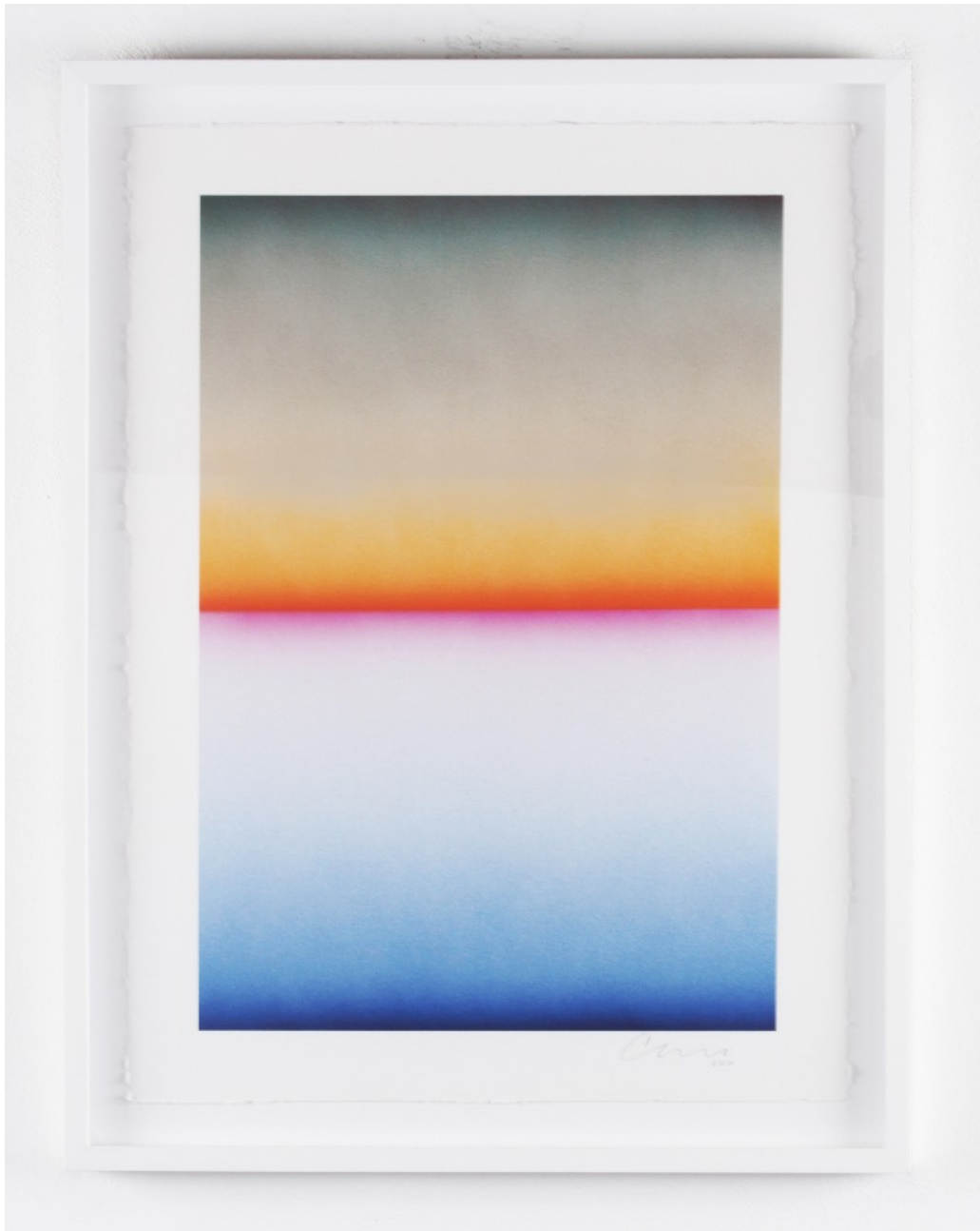
Casper Brindle, Untitled #9 , 2018, acrylic on paper, 30" x 22" unframed, 34" x 26" framed, $3,900