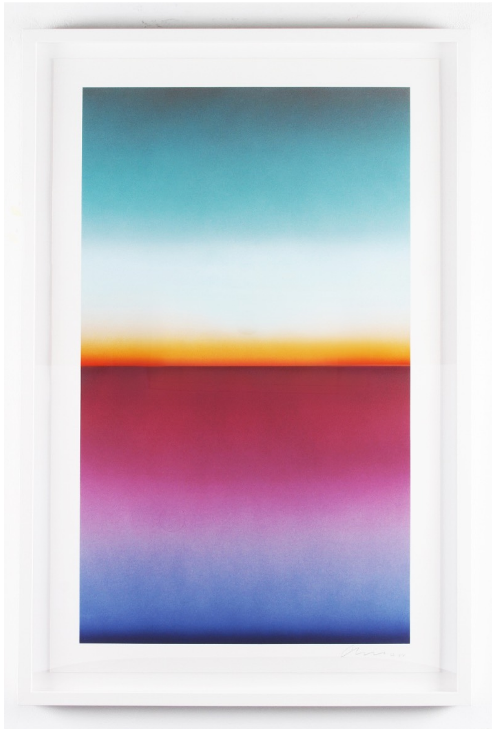
Casper Brindle, Untitled #1 , 2018, acrylic on paper, 48" x 30" unframed, 53" x 35" framed, $7,500