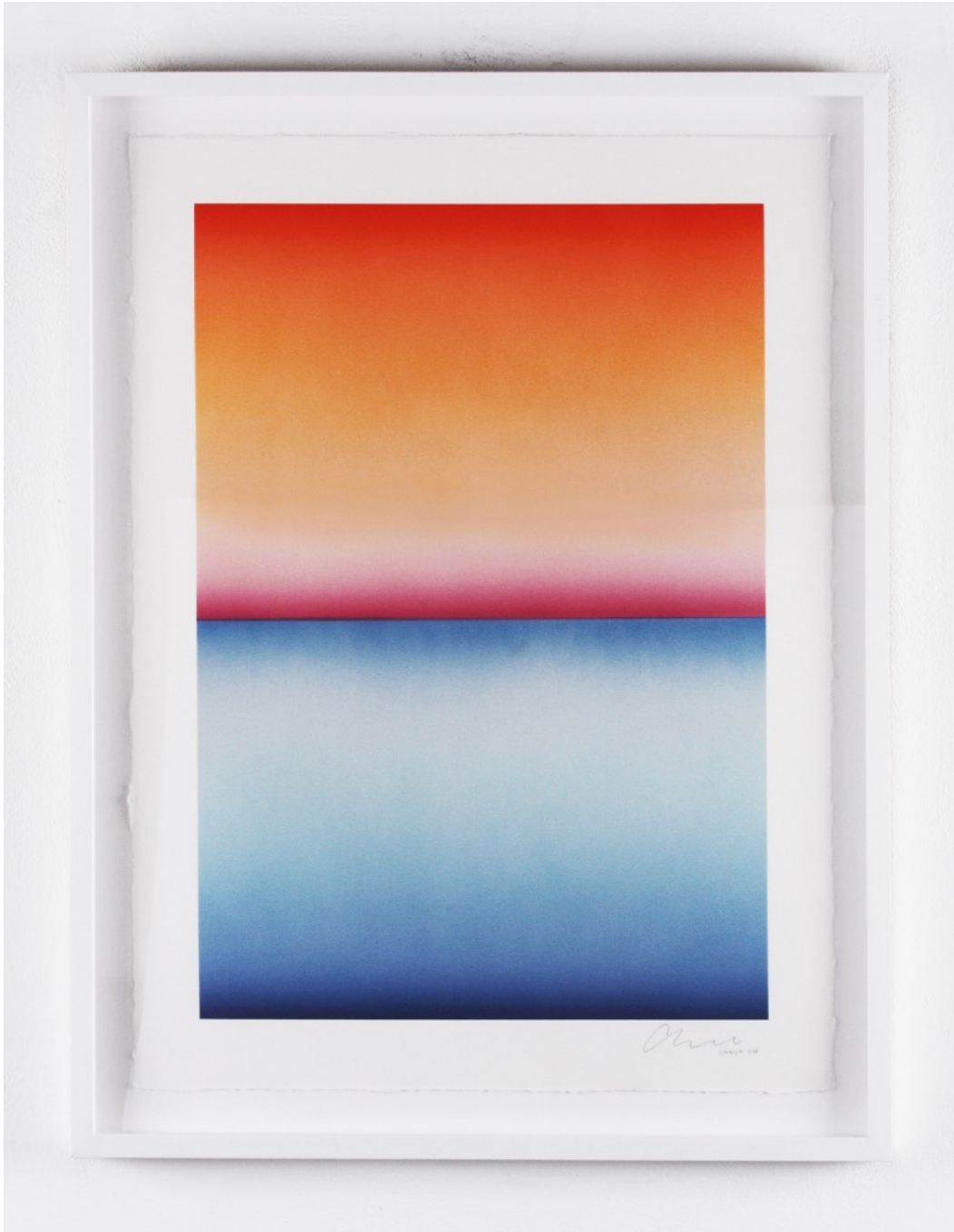
Casper Brindle, Untitled #12 , 2018, acrylic on paper, 30" x 22" unframed, 34" x 26" framed, $3,900