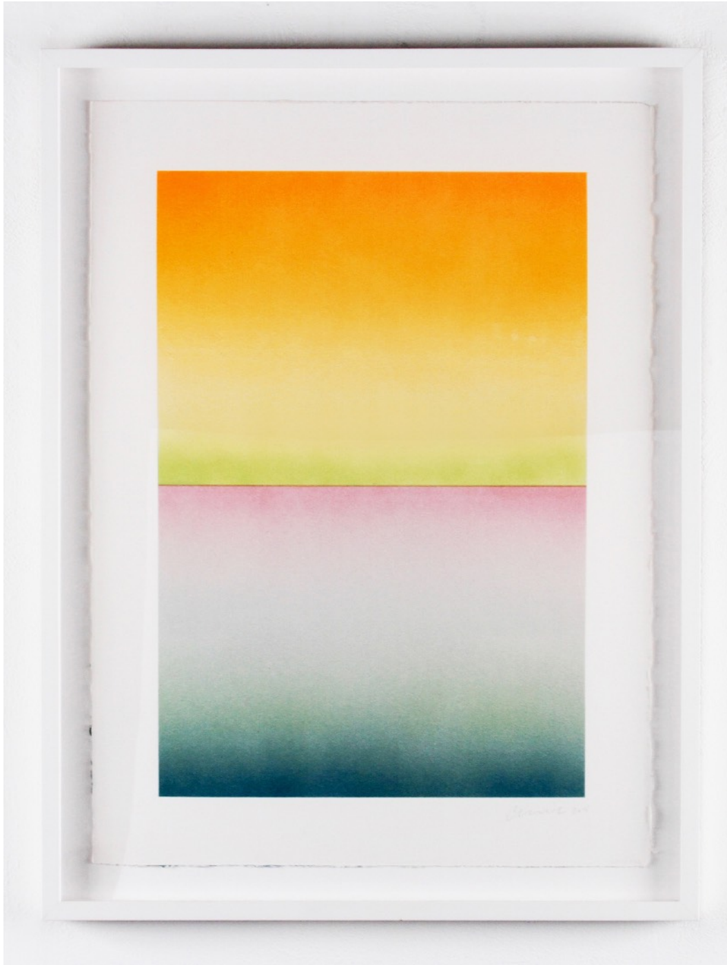
Casper Brindle, Untitled #10 , 2018, acrylic on paper, 30" x 22" unframed, 34" x 26" framed, $3,900