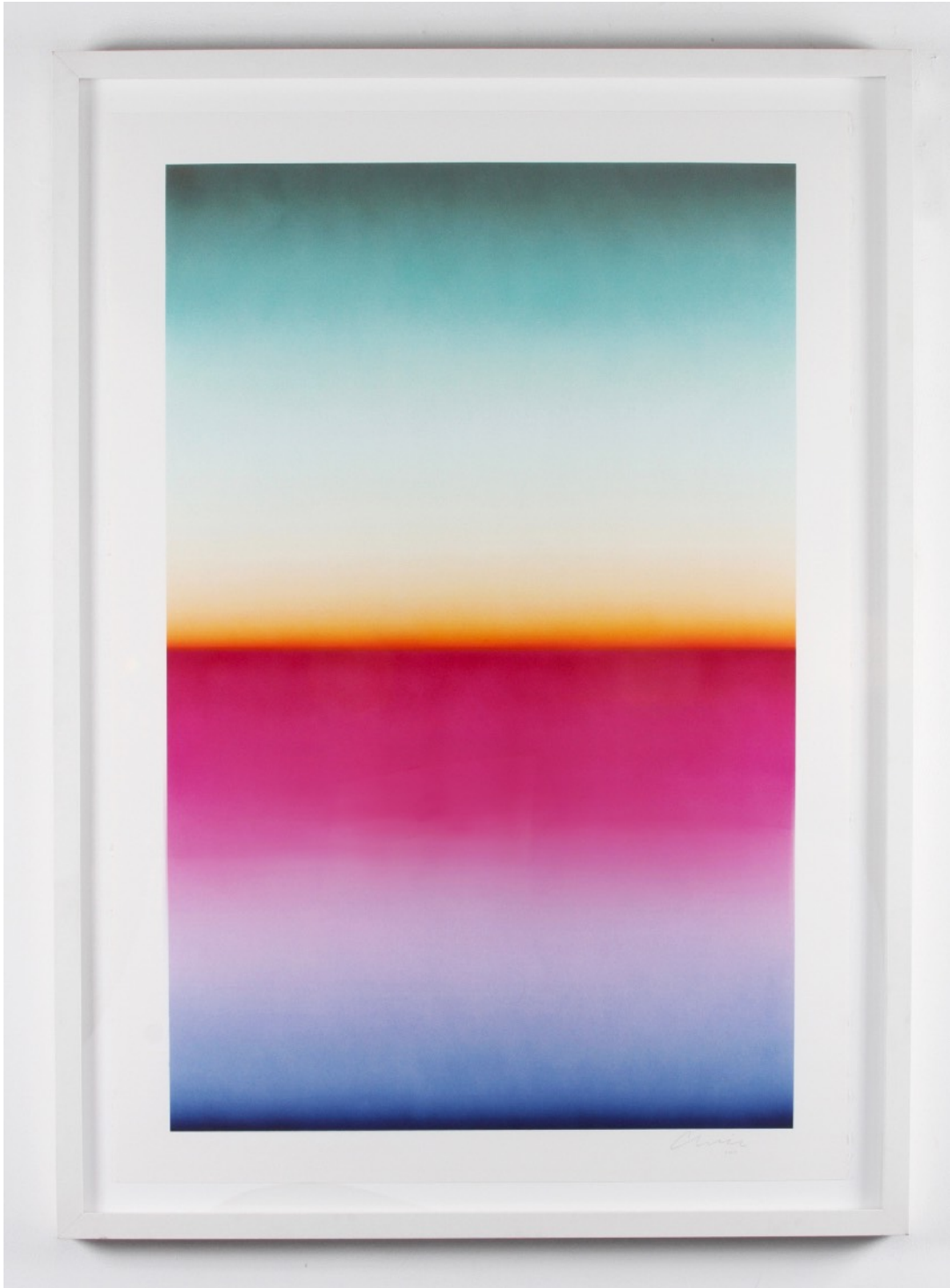
Casper Brindle, Untitled #6 , 2018, acrylic on paper, 60" x 42" unframed, 66" x 48" framed, $9,500