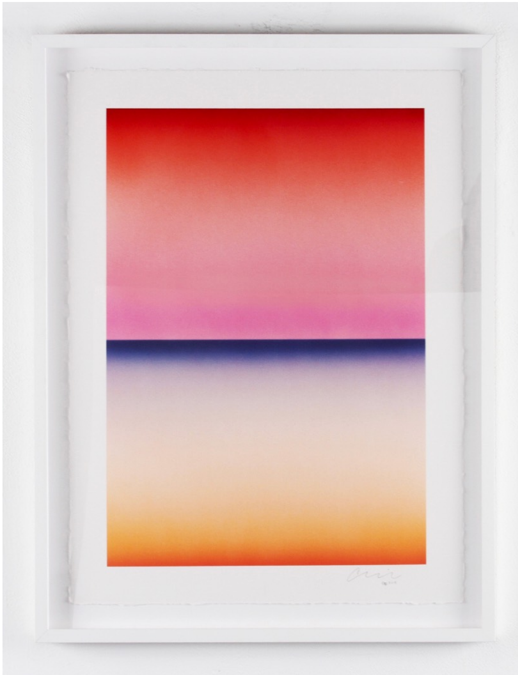
Casper Brindle, Untitled #7 , 2018, acrylic on paper, 30" x 22" unframed, 34" x 26" framed, $3,900