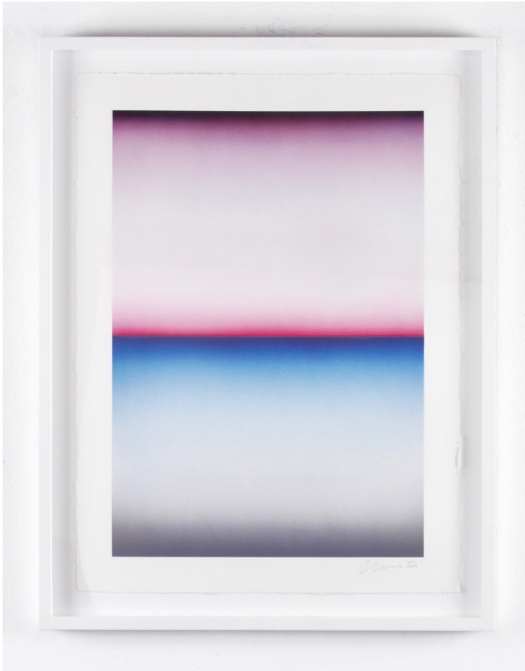
Casper Brindle, Untitled #11 , 2018, acrylic on paper, 30" x 22" unframed, 34" x 26" framed, $3,900