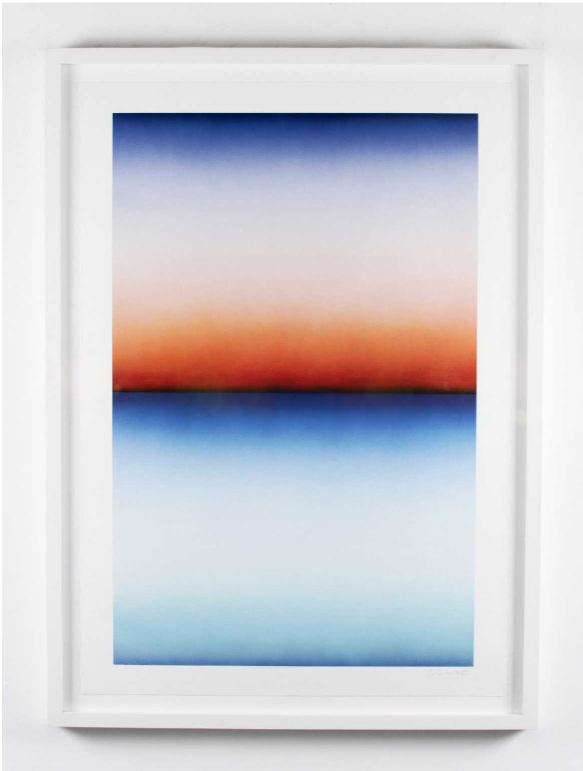
Casper Brindle, Untitled #2 , 2018, acrylic on paper, 60" x 42" unframed, 66" x 48" framed, $9,500