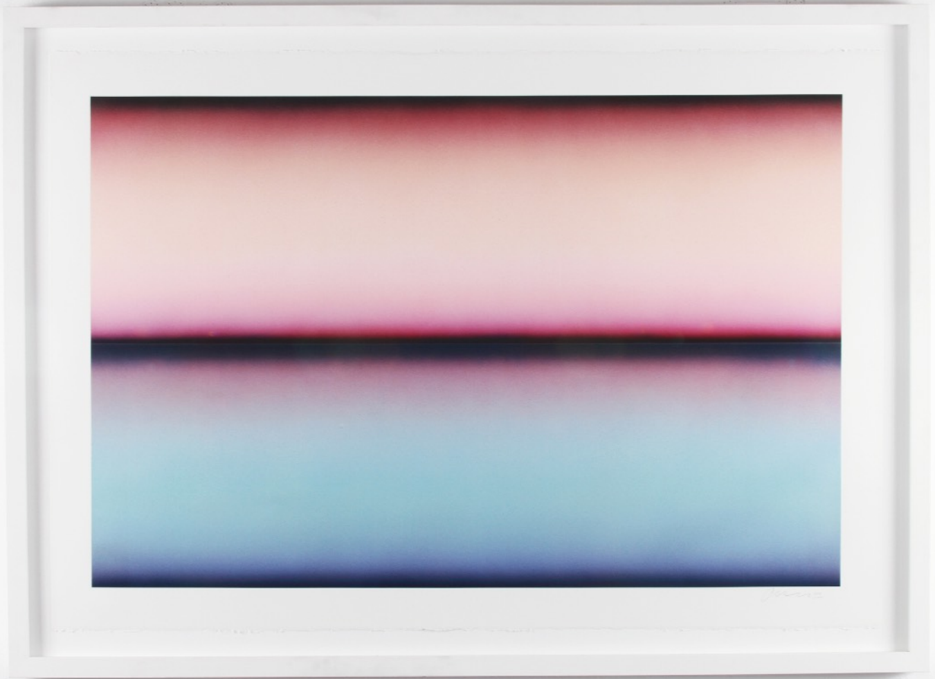
Casper Brindle, Untitled #5 , 2018, acrylic on paper, 42" x 60" unframed, 48" x 66" framed, $9,500