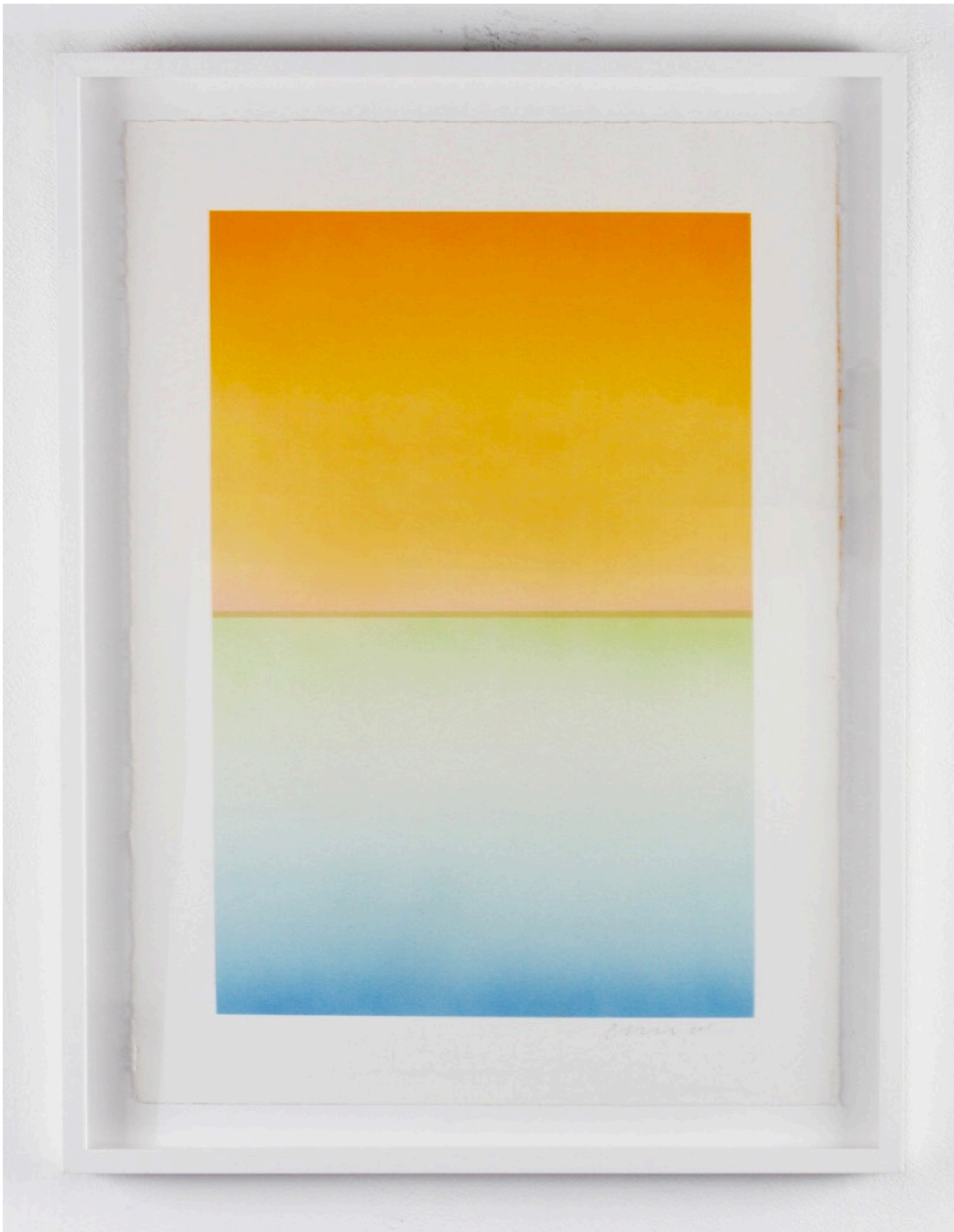
Casper Brindle, Untitled #8 , 2018, acrylic on paper, 60" x 42" unframed, 66" x 48" framed, $3,900