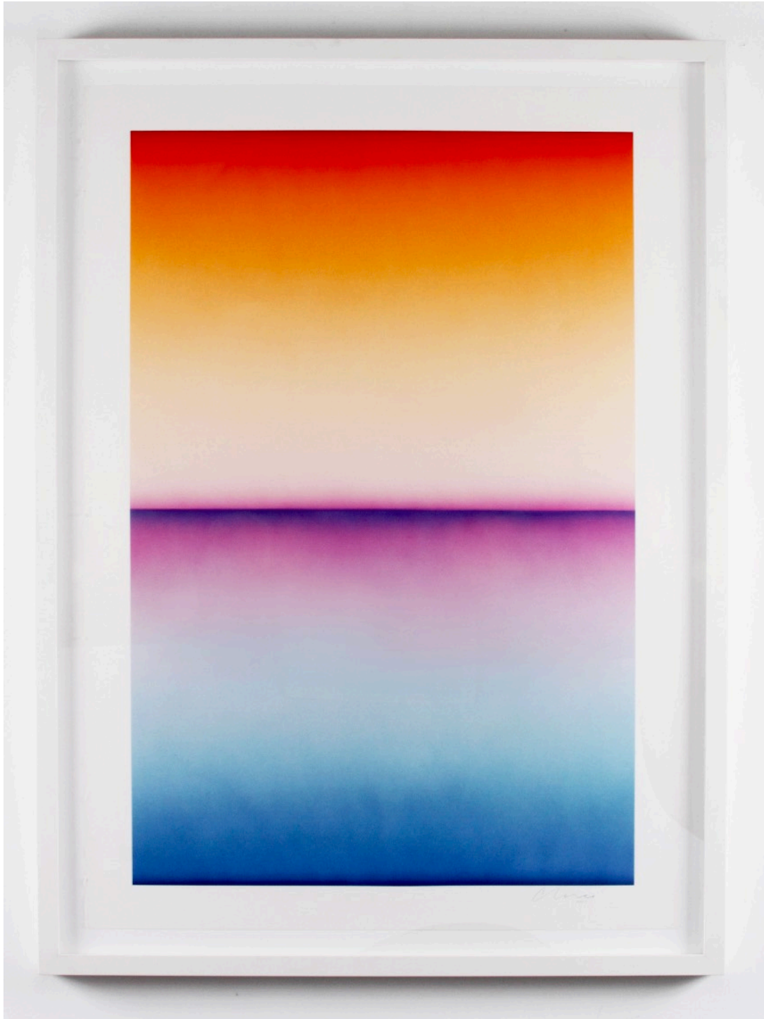
Casper Brindle, Untitled #3 , 2018, acrylic on paper, 60" x 42" unframed, 66" x 48" framed, $9,500