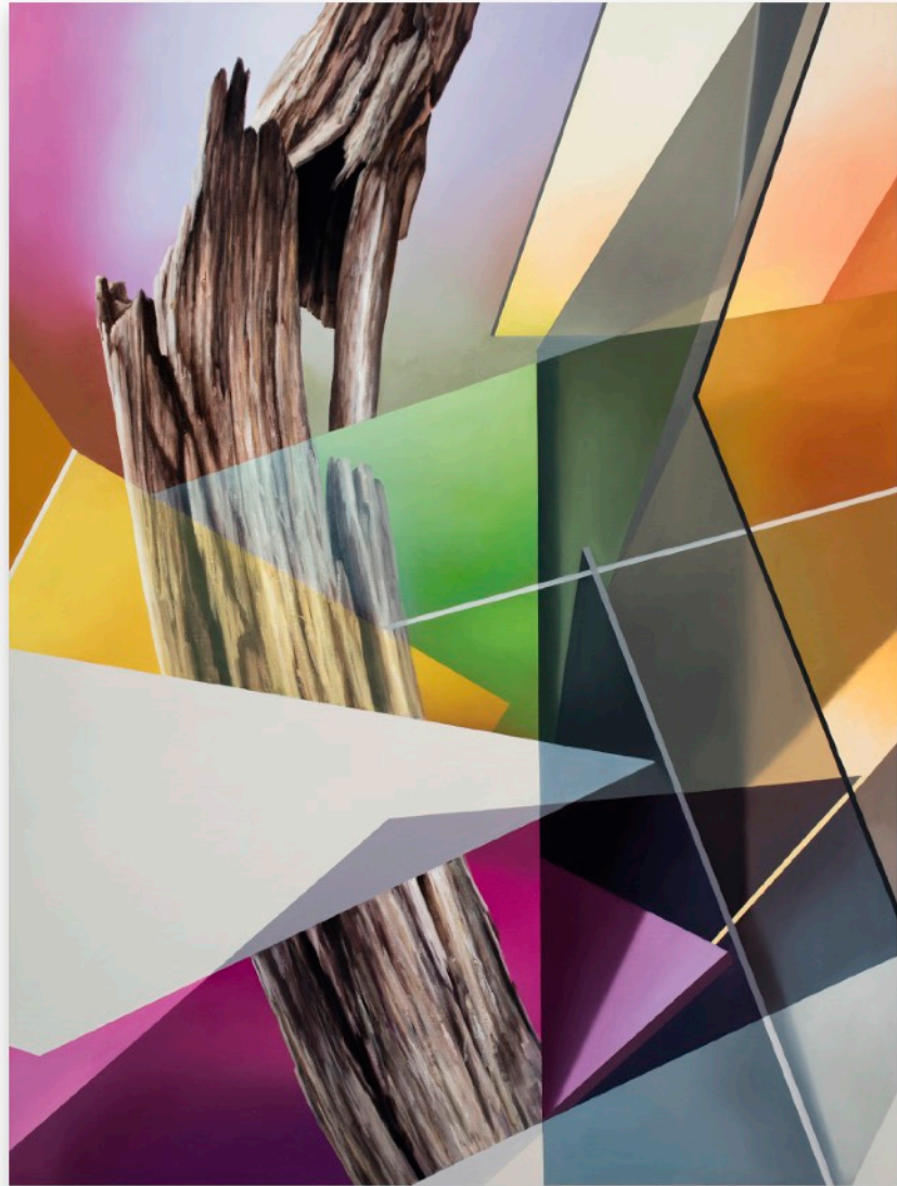
Javier Peláez, Broken Tree #5 , 2019, oil on linen, 62.9" x 47.5" x 1.37", $16,500