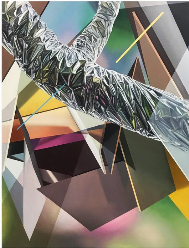
Javier Peláez, Broken Tree #1 , 2019, oil on linen, 62.9" x 47.5" x 1.37", $16,500