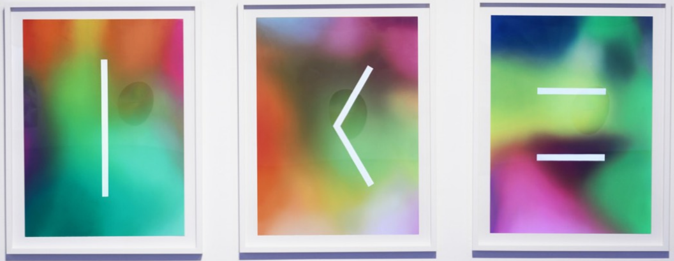
Javier Peláez, Split Triptych , 2019, oil on paper, 34" x 26" each, $4,500 each