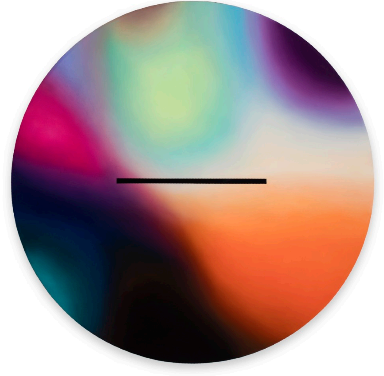
Javier Peláez, Vapor #1 , 2019, oil on linen, 63" diameter, $17,500