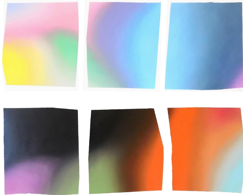
Javier Peláez, Broken Tree #9 a-f , 2019, oil on paper, 21" x 17" framed each, $9,500 for the set of 6