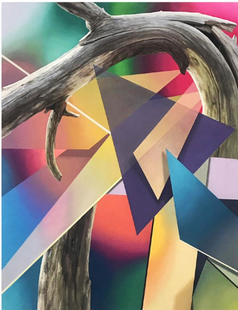
Javier Peláez, Broken Tree #4 , 2019, oil on linen, 62.9" x 47.5" x 1.37", $16,500