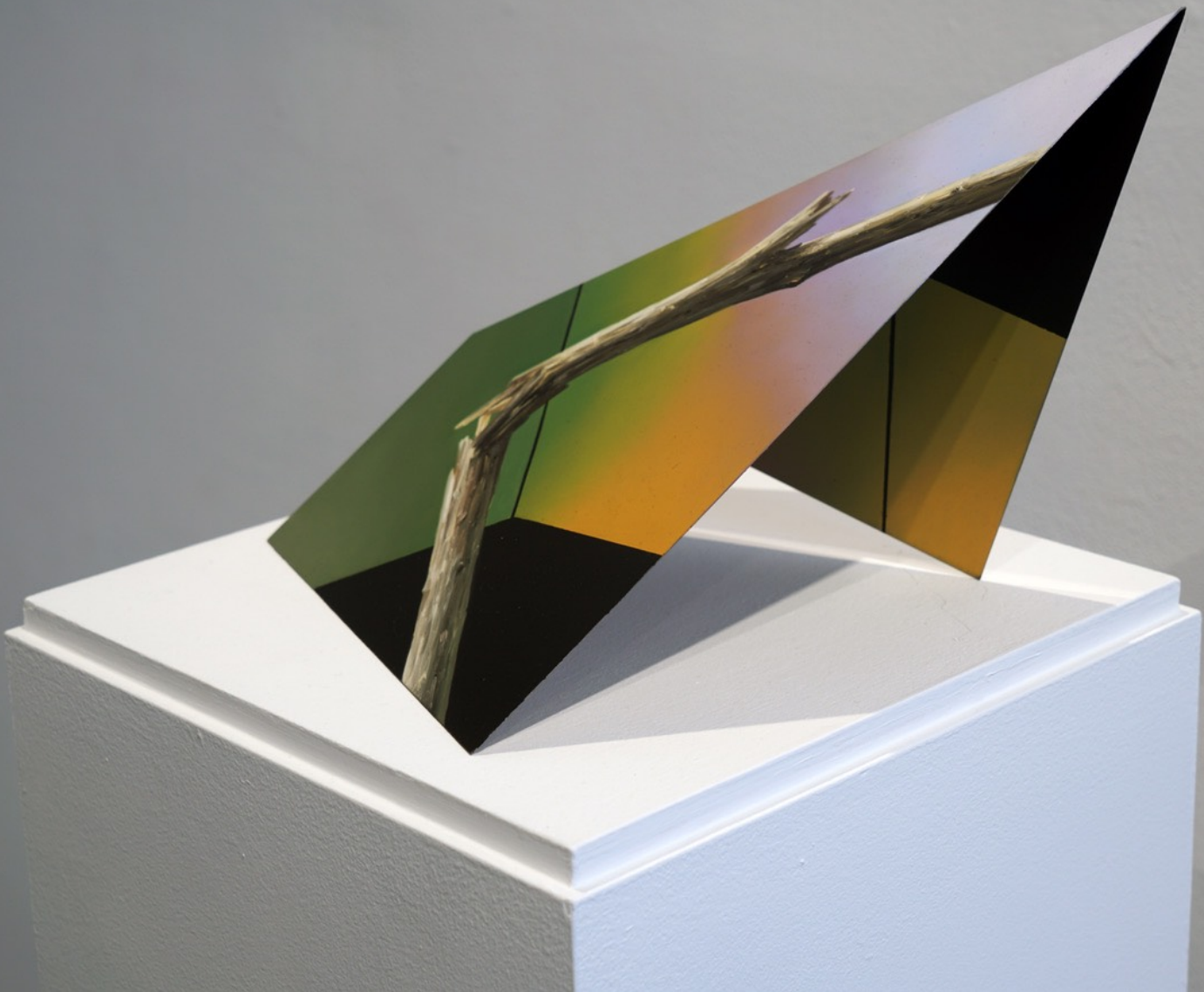
Javier Peláez, Broken Tree #10 , 2019, oil on stainless steel, 13" x 8" x 6", $2,800 Installation view