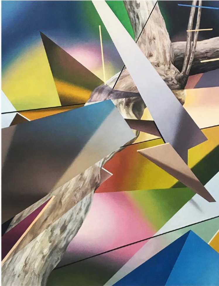
Javier Peláez, Broken Tree #2 , 2019, oil on linen, 62.9" x 47.5" x 1.37", $16,500