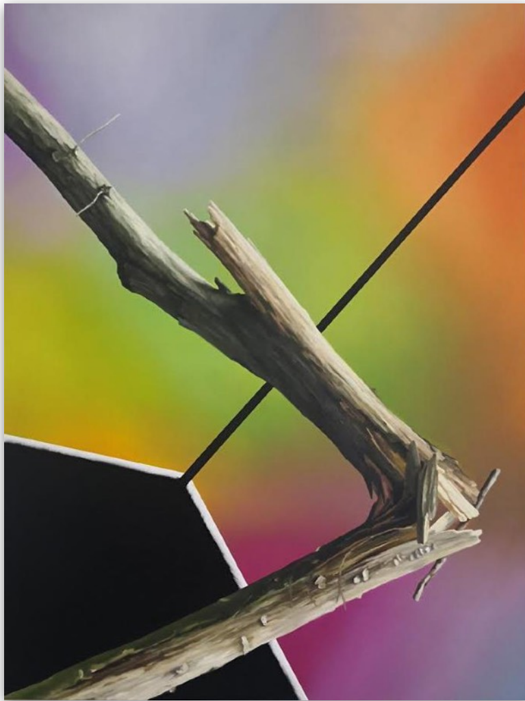
Javier Peláez, Broken Tree #6 , 2019, oil on linen, 62.9" x 47.5" x 1.37", $16,500