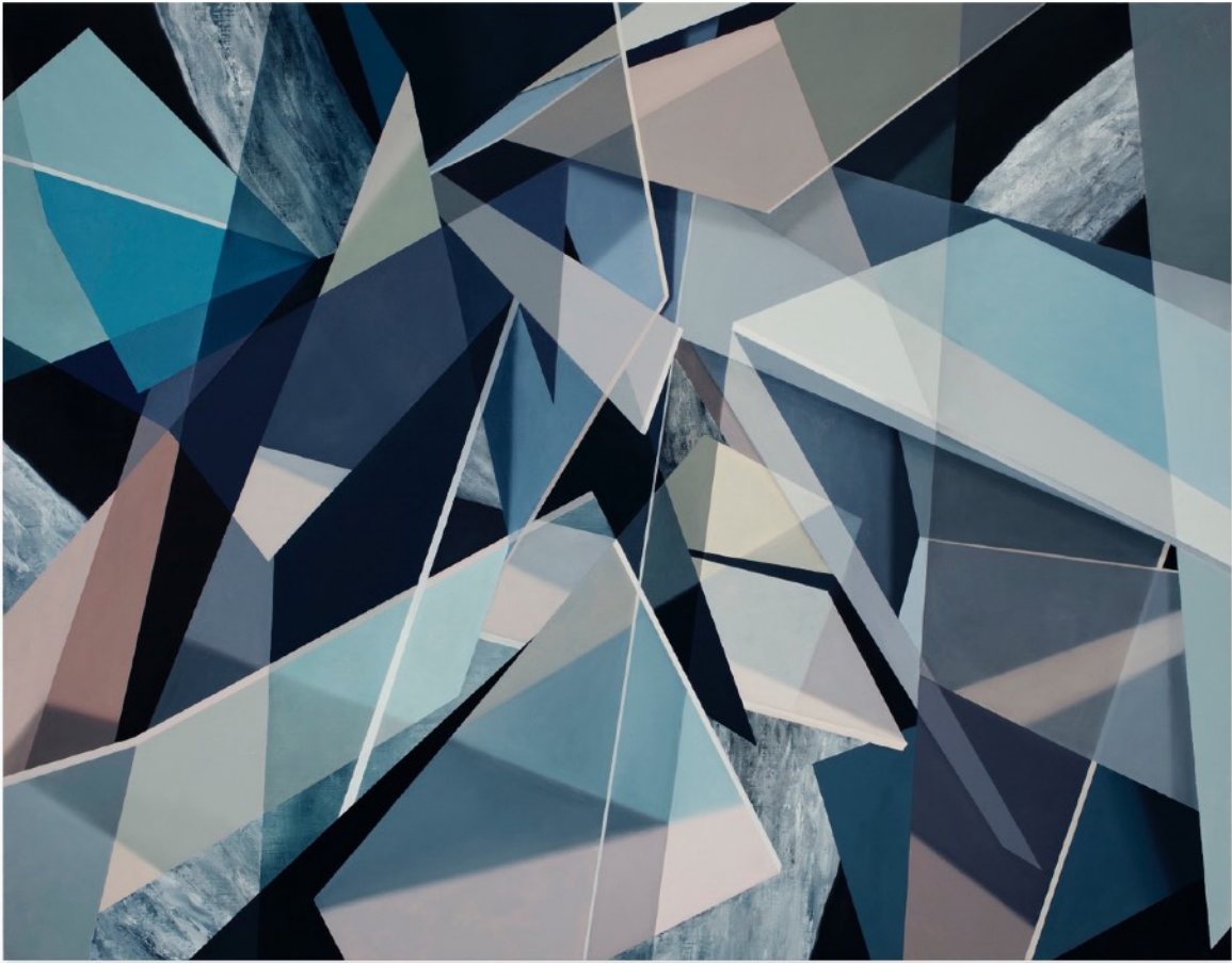
Javier Peláez, Broken Tree #7 , 2019, oil on linen, 74.8" x 59" x 1.37", $18,500