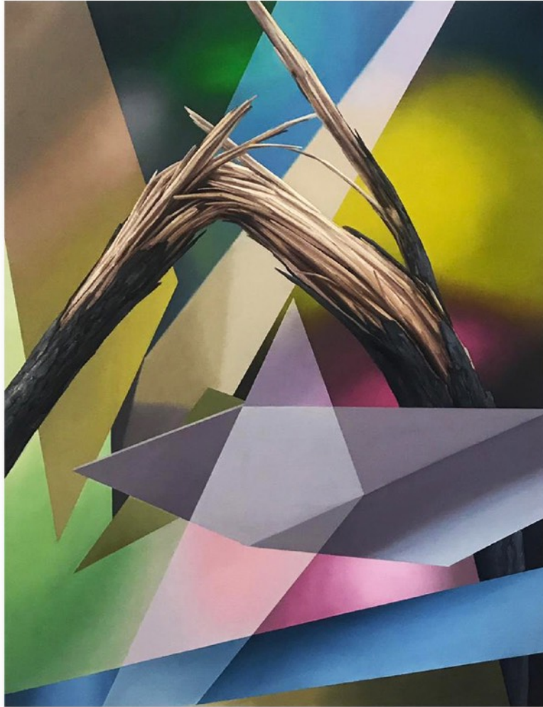
Javier Peláez, Broken Tree #8 , 2019, oil on linen, 62.9" x 47.5" x 1.37", $16,500